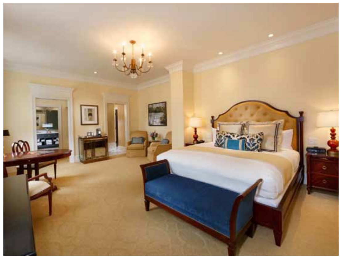
Hayes & Fisk Photography