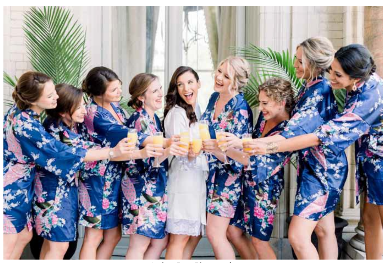
Audrey Rose Photography

We request that you provide a list of contact names, telephone numbers and e-mail addresses for all your vendors.