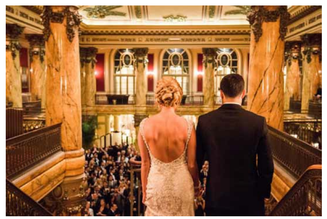
Hudson Nichols Photography

We are honored to assist you in making all your wedding dreams come true.