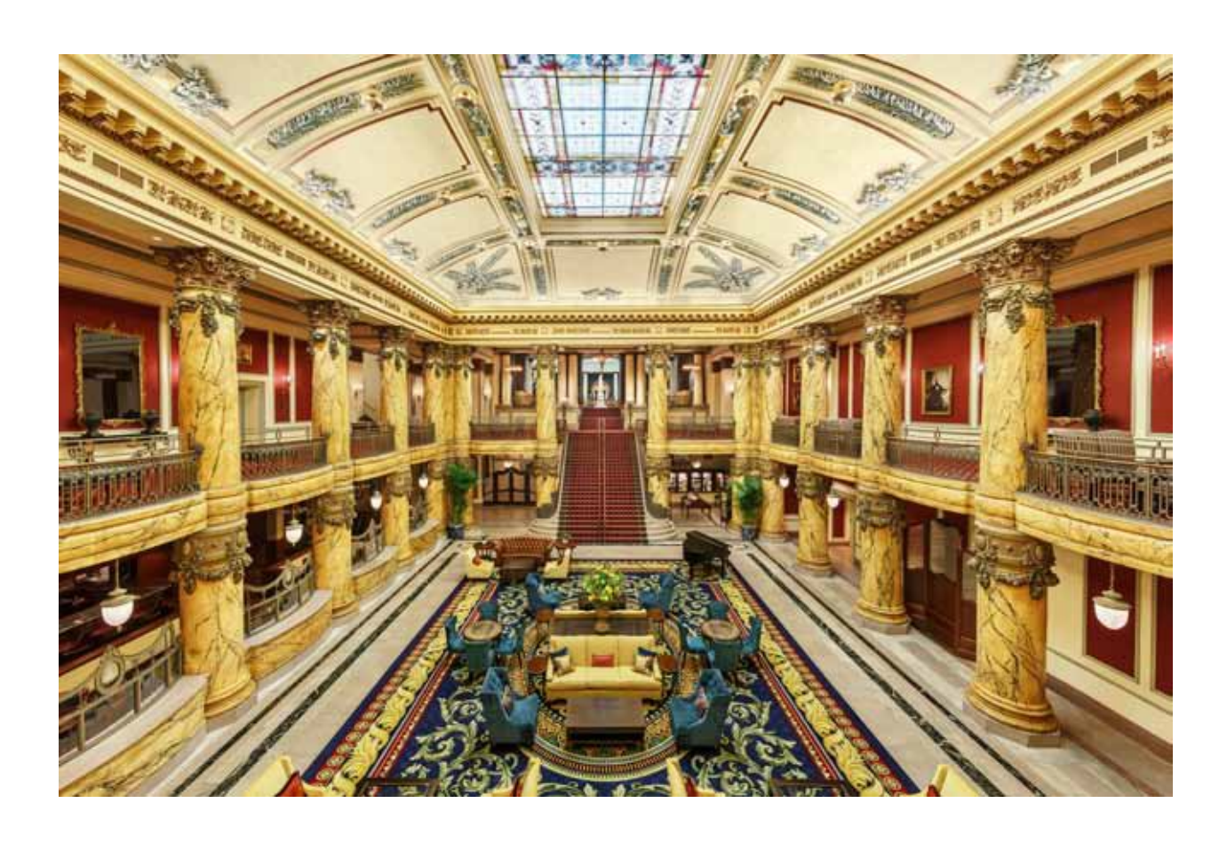
Hayes & Fisk Photography